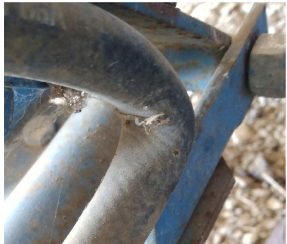
Figure 1. Crimps in hoses may lead to cracking.

Before your start, put on a pair of gloves to protect yourself from pesticide residues. Begin by filling your sprayer with clean water, but before you engage the pump, look for leaks from around the pump, hoses, strainers, and nozzles. Pay particular attention to the hoses, as these often show signs of wear sooner than other more durable parts. Besides obvious leaks from hoses, inspect hoses for cracking and signs of dry rot as these can burst when pressurized. Places where hoses might crimp with folding booms are prone to cracking as hoses age. Engage the pump and look again for leaks. Check the pressure gauge and test the cutoff valves to be sure they are working.