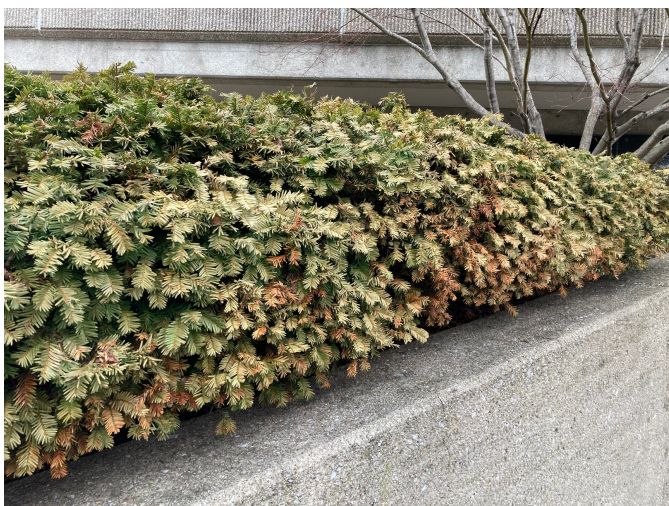
Figure 1: Taxus shrubs along an exposed border show needle discoloration from winter drying.

Since the beginning of January, most of the samples with winter injury that have arrived in the PDDL have shown symptoms of winter drying. On broadleaf evergreens (boxwood, cherry laurel, holly, magnolia, rhododendron, etc.) symptoms typically include marginal leaf scorch, irregular spotting, complete browning of the leaves, and occasionally extensive leaf drop. Conifer (arborvitae, Leyland cypress, Cryptomeria, juniper, etc.) symptoms include pale, bronze or brown needles or needle tips, particularly on the exterior foliage and branch tips. Symptoms are often more noticeable on the wind-exposed side of affected plants.