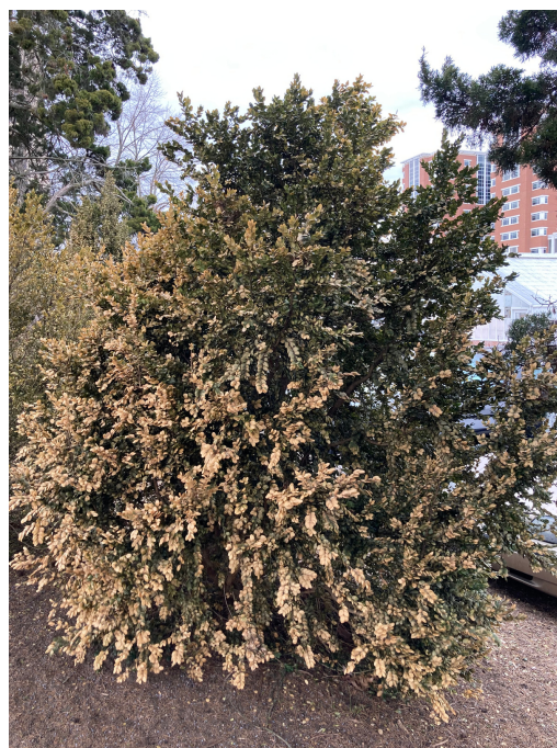
Figure 2: Severe leaf burn on windward side of boxwood