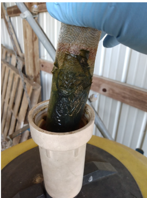
Figure 2. Check strainers regularly and clean or replace them as needed.